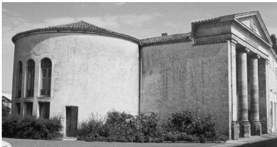
Reformed Church (Calvinist Temple) at Marenes, France